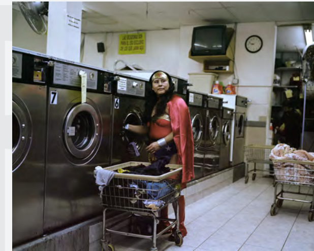
Wonderwoman, 2005-2010 C-print, 19-3/4 x 23-3/4