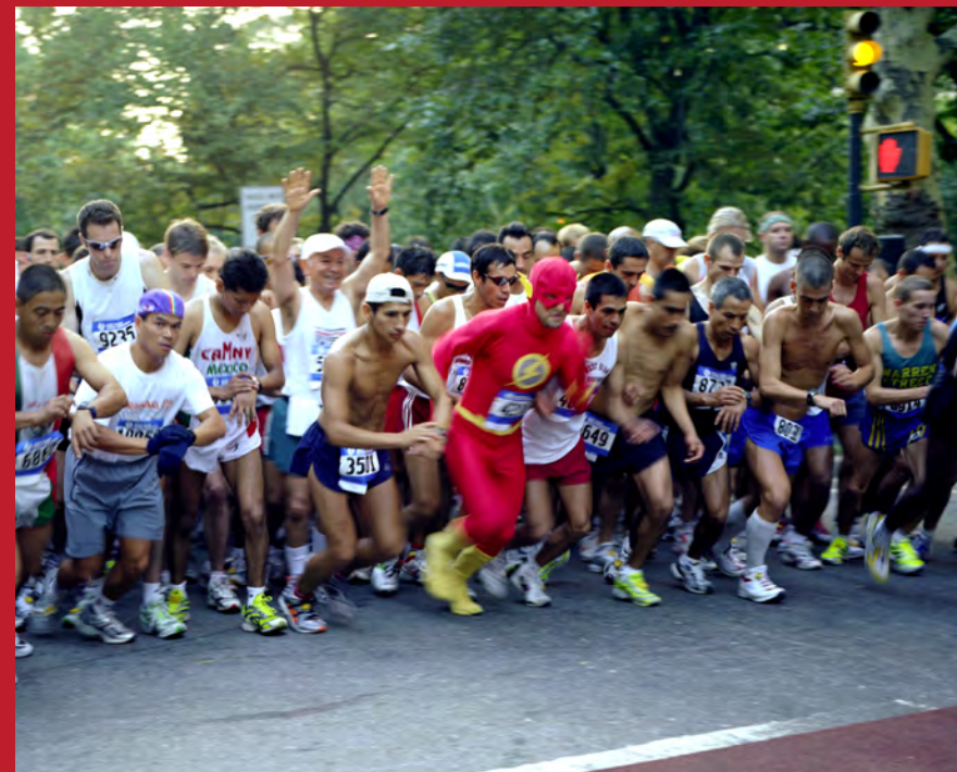
Flash, 2005-2010 C-print, 19-3/4 x 23-3/4