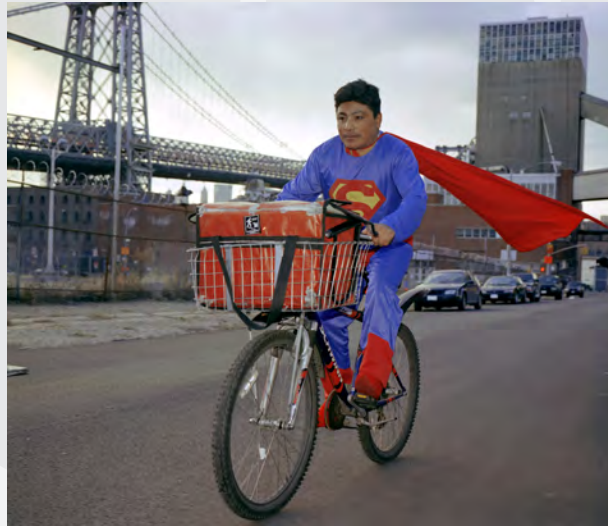
Superman, 2005-2010 C-print, 19-3/4 x 23-3/4