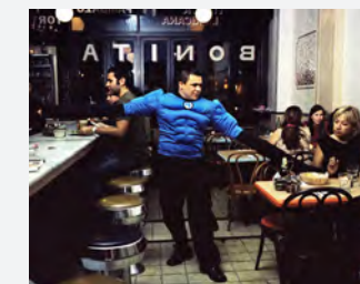
Mr. Elastic, 2005-2010 C-print, 19-3/4 x 23-3/4