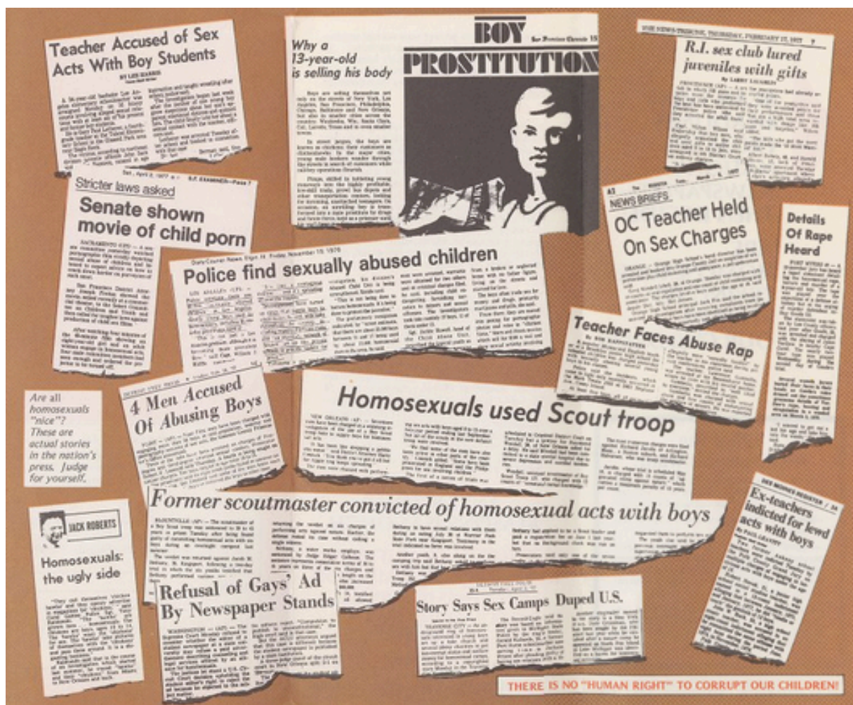
Figure 1. “Save our children from homosexuality!” pamphlet (side 2), ca. 1977, box 11, folder 7, Collection #7439, James M. Foster Papers, Division of Rare and Manuscript Collections, Cornell University Library.

schools as a vehicle for employing their perverted ideas with impunity.” 49 SOC rejected the civil rights claim of teachers with a child protection argument cloaked in parental rights, asserting that “there is no ‘human right’ to corrupt our children.” 50 According to SOC, Ordinance 77-4 would allow homosexuals to promote their agendas in the classroom and give them free rein to have sex with students. To clarify this point, SOC compiled a file of newspaper clippings that they used in campaign material to suggest that homosexual teachers were natural sexual predators. 51