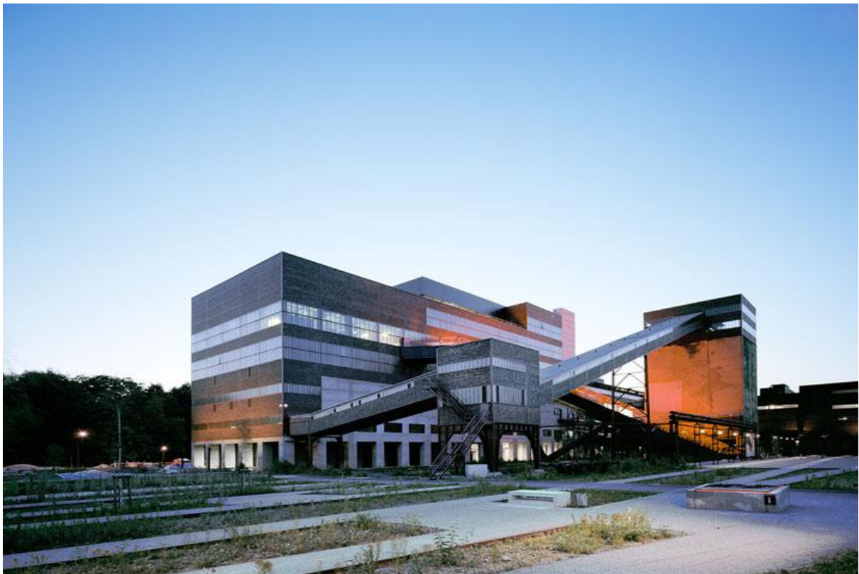
The Ruhr Coal Museum, a former coal washing plant