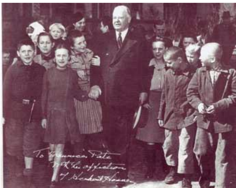
Herbert Hoover with Polish orphans