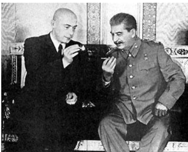
Polish Prime Minister Józef Cyrankiewicz with Soviet Premier Joseph Stalin