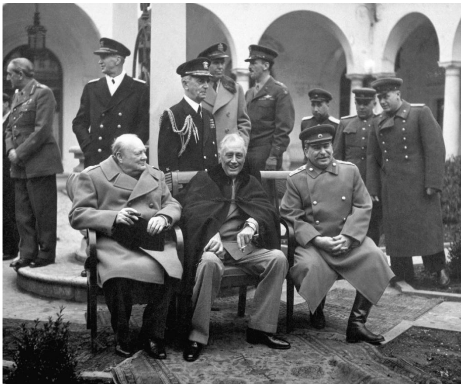
Winston Churchill, Franklin D. Roosevelt, and Joseph Stalin at the Yalta Conference

that Roosevelt's treatment of Poland as a relatively low priority influenced the Truman administration's foreign policy. Then I discuss Poland's first applications to the US State Department and the Export-Import Bank in 1945 and 1946 while describing the simultaneous deterioration of Polish-American relations due in part to the Polish nationalization of property. In this section I also show how the Polish balance of payments data from this time period supports the Polish argument that Poland needed a large American loan to restart its economy. In my fourth and fifth chapters I analyze Poland's application to the World Bank in 1947 and the US government's support for the German coal industry, a decision that finalized the close of the Polish debate for the US government and American lending institutions.