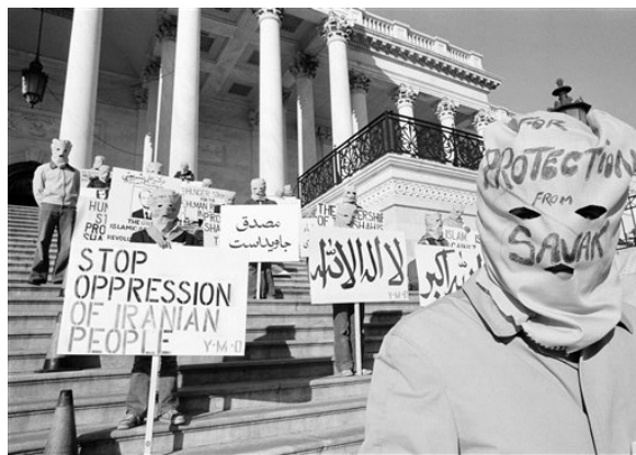
Figure 5. Demonstrator wearing anti-SAVAK mask on Capitol Hill. 197

The anti-SAVAK campaign, which elicited increasingly more attention between 1970-1979, became tethered to the greater anti-regime opposition. The fusion of these initially distinct efforts became apparent toward the end of the decade, when student protests against the Shah reflected an outward fear of SAVAK. The image of a protestor below, taken one day before the Shah was scheduled to arrive at the White House in 1977, embodies this final stage of the anti-SAVAK campaign.