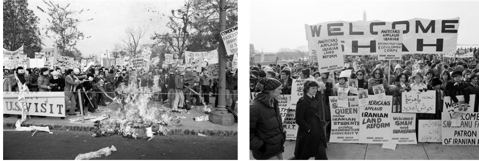
Figure 3. (left) Anti-Shah protestors organize against the Shah's visit to the White House. 183