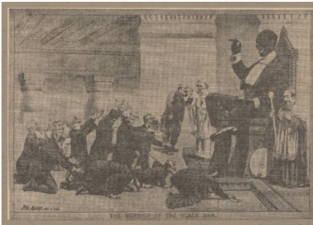
Figure 2 Cartoon published in 1889 in the St Stephens Review depicting influential liberal politicians bowing at the feet of an oversized “black man,” dressed in a dinner jacket and smoking a cigar. The publication mocked the liberal outcry of righteous indignation over Salisbury's racialized remark against Naoroji. 93

Beyond merely condemning Salisbury’s poor leadership, many liberal outlets also lamented the offense that the remark lay on Naoroji. Indeed, The Freeman's Journal , which— as