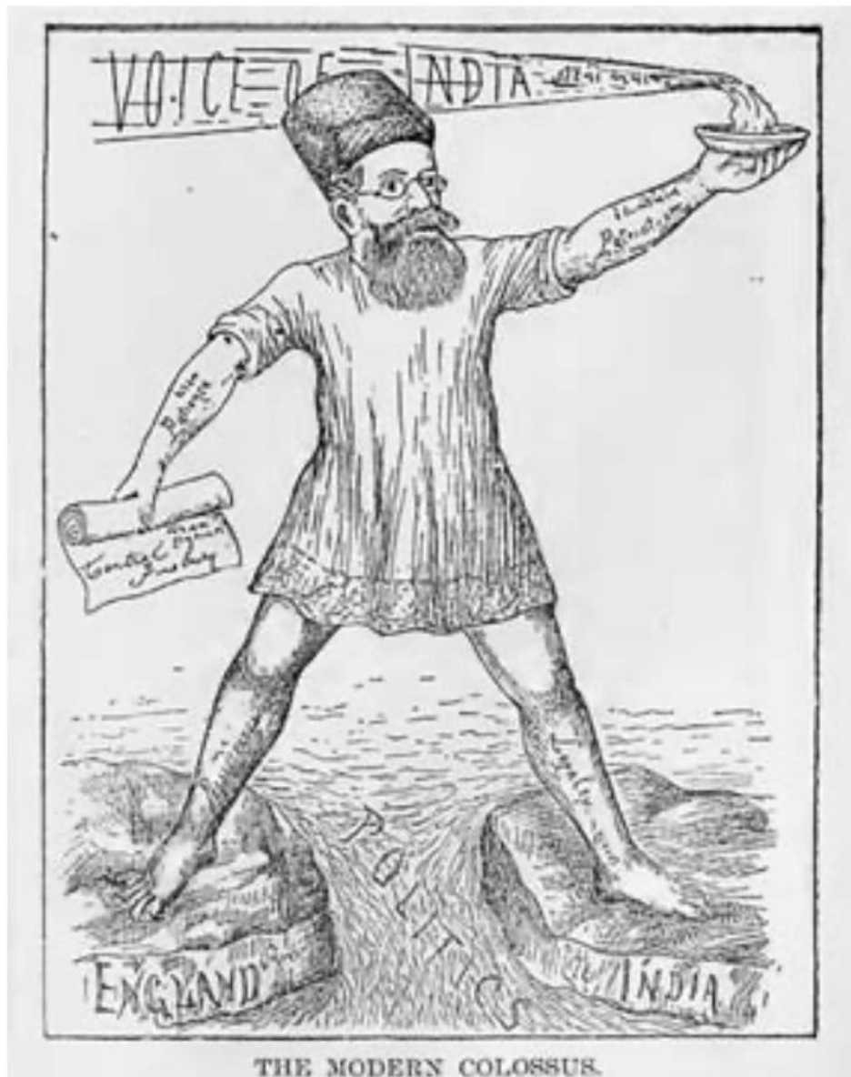
Figure 1: Review of Reviews (New York), October 1892, p. 279. 27

Although the value of having native concerns voiced through a spokesperson was widely accepted, not all public opinion credited Naoroji as being up to the job of such mediation. In a