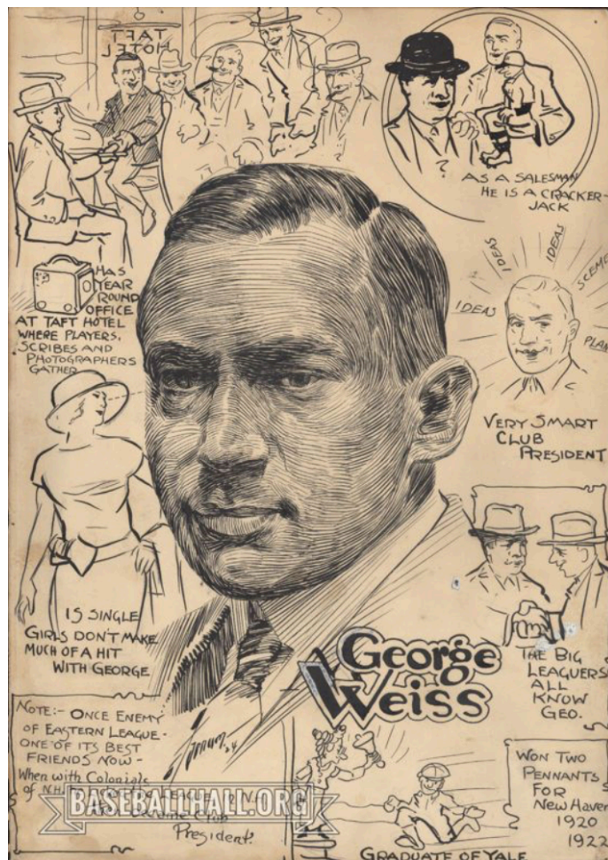
1. Cartoon of baseball club president George Weiss, 1922.