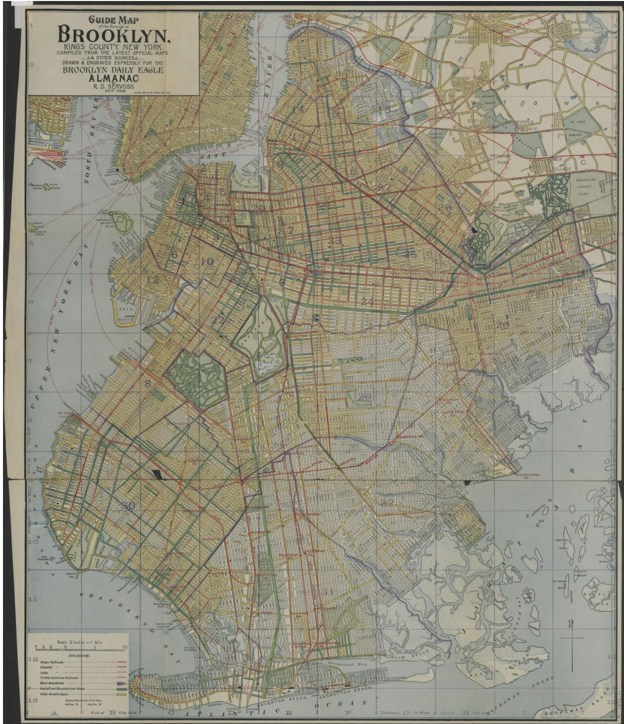
Figure 1: Map of Brooklyn and its Streetcar Lines, 1898. 4