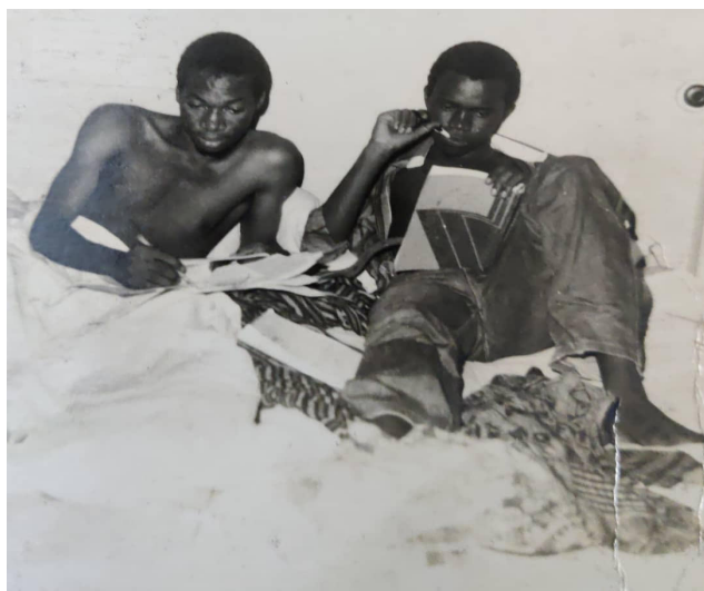
Figure 1: Students in a room for 5 with no furniture in University of Ibadan. 85

For the majority of university students in 1978, even though the changes to university education financing did not directly threaten their ability to go to/afford school, they were unhappy with the government’s decisions and felt aggrieved by the changes in university financing. As they understood it, the government did have the money to finance university accommodation and wealthy university students were being unfairly exploited.