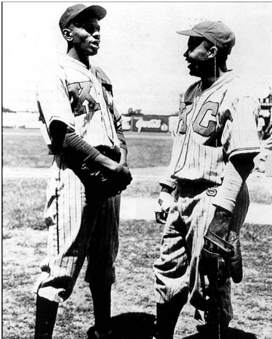
Paige and Robinson playing for the Kansas

As to the other half of this dichotomy, the field slave, that comparison belongs to the greatest pitcher ever to play in the Negro Leagues and perhaps the greatest pitcher in the history of baseball. Satchel Paige was an entertainer with an act designed to disguise his ruthlessness on the mound. On the basis of sheer talent, Paige probably should have been the first to break the color line. “The improvisatory array of Paige’s pitches directly questioned the immutable superiority of white styles of play.” 60 But Paige’s “act” was unmistakably reminiscent of Stepin Fetchit’s minstrel-inflected caricature of the slow, shiftless and devious field slave. “Satchel Paige sometimes did a ‘Stepin Fetchit’ which was an exaggerated slow stroll to the mound that would have appalled today’s sensibilities...” 61