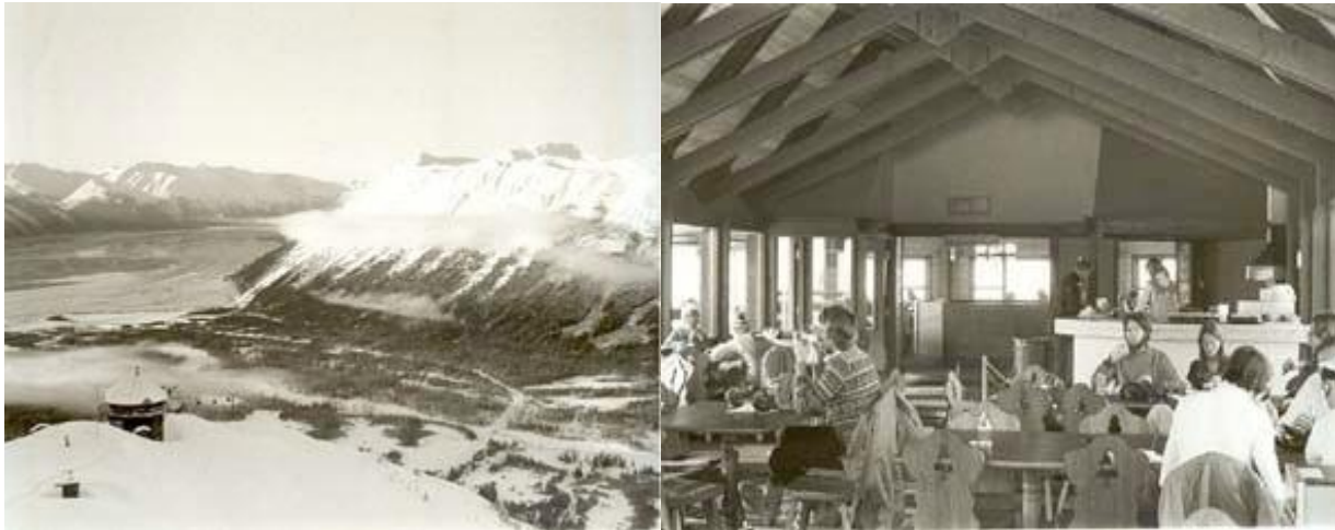
Early photos of the Mt. Alyeska Roundhouse (left) and the Main Lodge (right) from the Roundhouse at Alyeska Museum 191

Mt. Alyeska is only a fifty minute drive from Anchorage, but lies deep in the Chugach Mountains. The distinctive octagonal Roundhouse sits on an exposed ridge, 2,280 feet above sea level. Since its construction in 1959, it has served as a warming hut and mountain gathering place. A ski lodge rests below it -- a popular destination for adventurers and mountaineers. 190