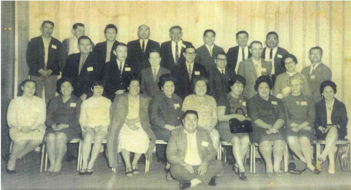
One of the earliest known statewide Magistrate's Conferences in Anchorage, AK, 1961 75