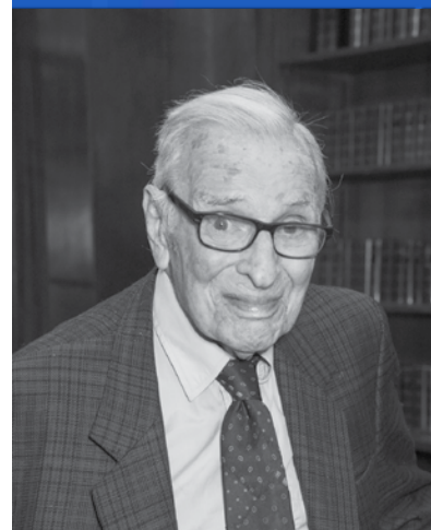
Professor Arrow at the 9th Annual Arrow Lecture in December 2016.