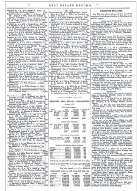
Figure 1, 1929 Commissioner's Plan (left): This map shows the proposed additional rapid transit lines. Lee plans to use such information of routes not taken as her estimation strategy to estimate the impact of urban transit infrastructure. Figure 2, New York City's Zoning Map of 1916 (middle): New York City adopted the nation's first comprehensive land-use regulation ("zoning") in 1916. Lee has digitized and collected these planning maps, and georeferenced these archival maps to perform spatial analyses using GIS software. Figure 3, New York City's Real Estate Transaction Record Example (right): This is a sample image of real estate transaction records of New York City. Lee systematically digitized and created machine-readable database by systematically parsing relevant information.

an advisee of Professor Donald R. Davis. "New York City's transportation networks have dictated our centers of population growth, guided our industries and businesses, and shaped our city. The city can focus on what they are really good at, what they do," she adds.