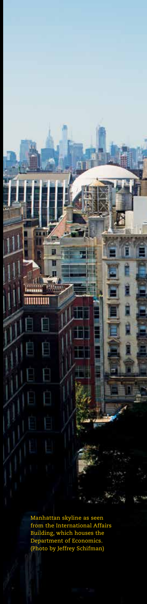
Manhattan skyline as seen from the International Affairs Building, which houses the Department of Economics.