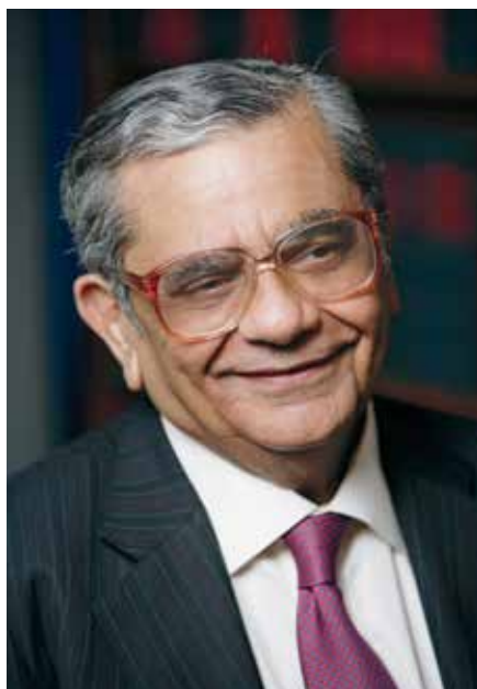
Pictured below, left: Jagdish Bhagwati.

The event was jointly sponsored by the Program for Economic Research, the Jerome A. Chazen Institute for Global Business at Columbia Business School, and the Center on Global Economic Governance at Columbia University.